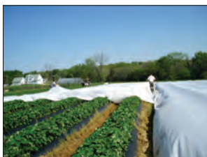
Frost Protect. Row Covers