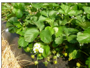
Flowers and Green Fruit