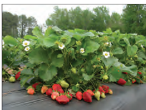
Ripe and Unripe Berries