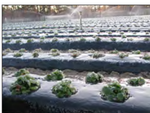
Frost Protection, Irrigation