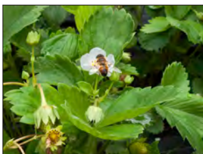
Flower with Bee