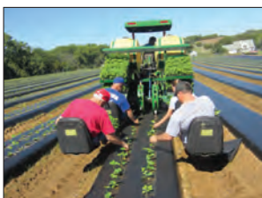
Setting Out Plants