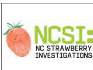
FULL SET (11 images)

Teaching Prints are part of the NC Strawberry Investigations curriculum, which includes K-5 lesson plans and additional resources. The lessons can be accessed for free online, after a simple registration process. For more information and a link to the registration page, visit www.ncstrawberry.com/docs/NCSI-Introduction.htm .